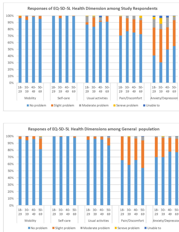
Figure 2. Health Status of the Respondents When Comparing With General Populations.

worried infecting family) and health outcome (HRQoL-EQ5D disability, pain/discomfort, anxiety/depression) were all significantly associated with workplace policy (accessibility, transparency, comprehensiveness, timely) and measure (protective equipment supply), except the health status of mobility, self-care and social activity.