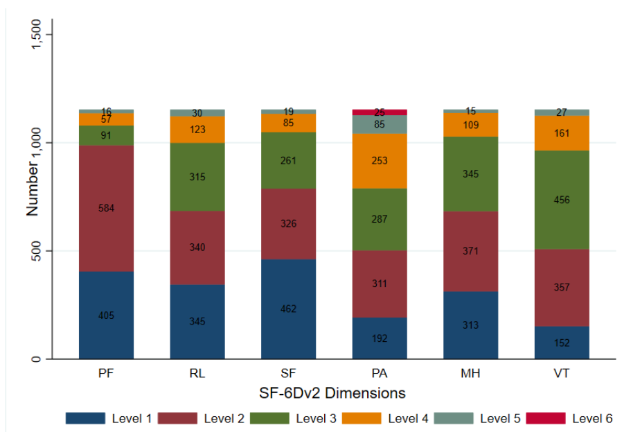
Figure 2. Distribution of the Reported Problems by Participants (level 6 only available for Pain). Abbreviations: SF-6Dv2, new version of Short-Form 6-Dimension; PF, physical functioning; RL, role limitations; SF, social functioning; PA, pain; MH, mental health; VT, vitality.

Table 3 showed the anchored models obtained from Model 2, 4, and 5. The coefficients generated by the models can be used to derive a SF-6Dv2 value set and enabling comparisons across different models. For all dimensions, the lower severity levels of Model 5 show a smaller reduction compared to the other Models. However, Model 5 shows a larger reduction for most dimension levels compared to the others. The anchored Model 2 generates values from 1 to -1.114, and 39.01% of all 18 750 states are negative in this model. Model 4 reveals that introducing the Design 2 choice sets reduces the utility range (1 to -0.693) and the percentage of negative states (to 13.01%). The level coefficients of Model 5, which are generally smaller than those of Model 4, include an additional decrement due to the WORST term. This leads to a narrower utility range (1 to -0.407) with a percentage WTD of 13.32%. Model 5, with four non-significant parameters, indicated a higher count of non-significant parameters compared to the other models. The ranking of importance, based on the overall dimension magnitude as a proxy for importance, also shows some changes across the models. It is PA, VT, RL, PF, SF, and MH in model 2, while this order remains consistent across models 4 and 5 with PA, PF, MH, SF, RL, and VT. The largest