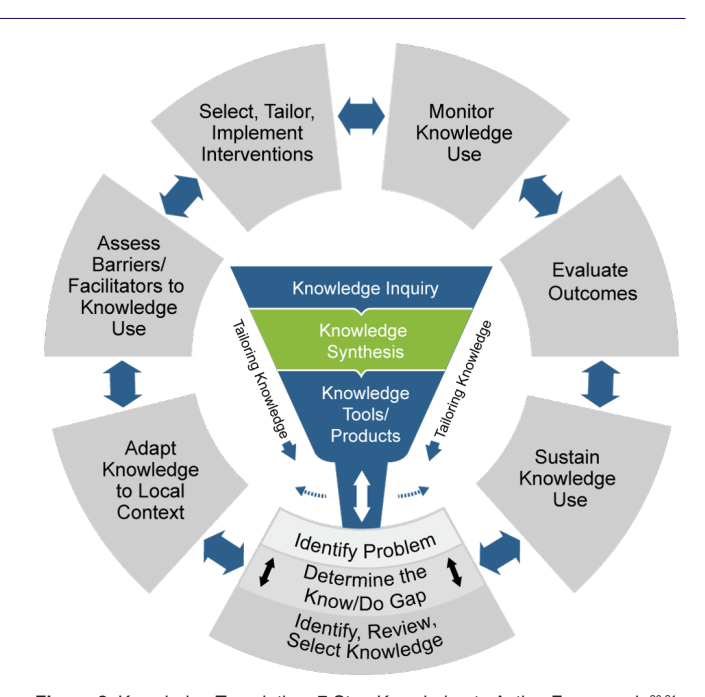
Figure 2. Knowledge Translation: 7 Step Knowledge to Action Framework. 20,21

Our definition of knowledge translation was based on the Canadian model<sup>20</sup>: "a dynamic and iterative process that includes the synthesis, dissemination, exchange and ethically sound application of knowledge to improve health, provide more effective health services and products and strengthen the healthcare system," engaging the 7-step knowledge to action (K2A) framework<sup>21</sup> (Figure 2).