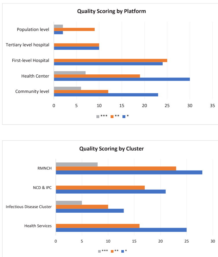
Figure 3. Quality Scoring by (a) Platform and (b) Cluster. Abbreviations: NCD, non-communicable disease; RMNCH, Reproductive, Maternal, Newborn and Child Health; IPC, injury prevention cluster.

In addition to empirical limitations, there are also theoretical concerns when transferring ICERs to support