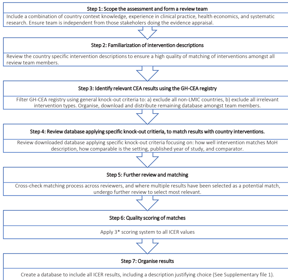
Figure 1. 7-Step Process 'Assessing ICERs for Health Benefit Package Design' in Pakistan. Abbreviations: GH-CEA, Global Health Cost-Effectiveness Analysis; LMIC, low- and middle-income country; ICER, incremental cost-effectiveness ratio; MoH, Ministry of Health.

The first step in our process was scoping the interventions