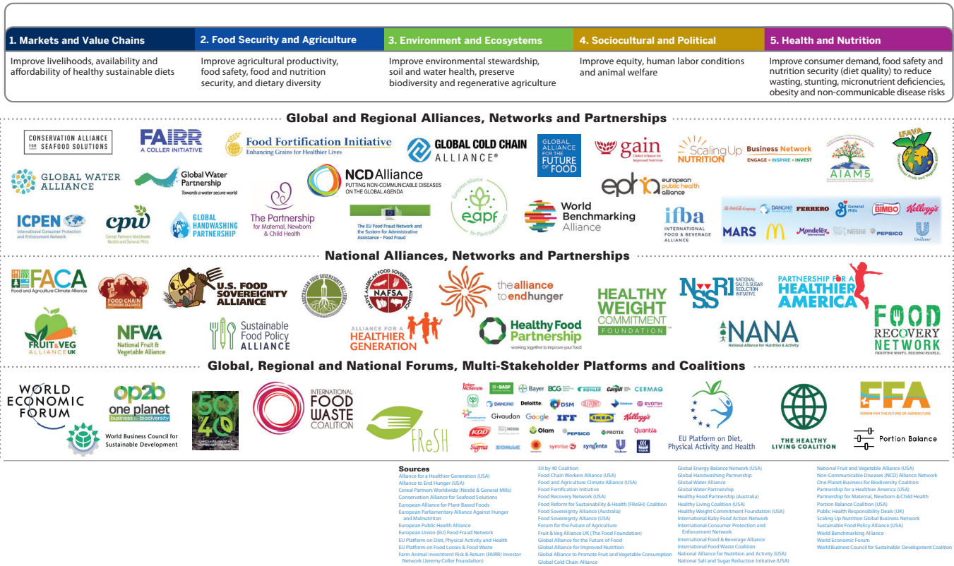
Figure 3. Examples of Actor Engagement Through Global, Regional and National Alliances, Networks, Partnerships, Forums, Platforms and Coalitions* that Promote Healthy and Sustainable Diets and Food Systems.

*Published evaluations are limited for many of these alliance, partnership, network and coalition examples to assess whether their voluntary commitments have translated into policies and actions to support healthy and sustainable diets and food systems at local, national, regional or global levels. Further research and evaluations are needed to document outcomes achieved.